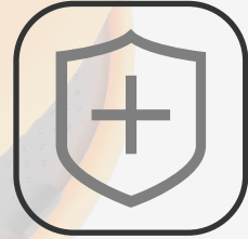
Silicon protection pad