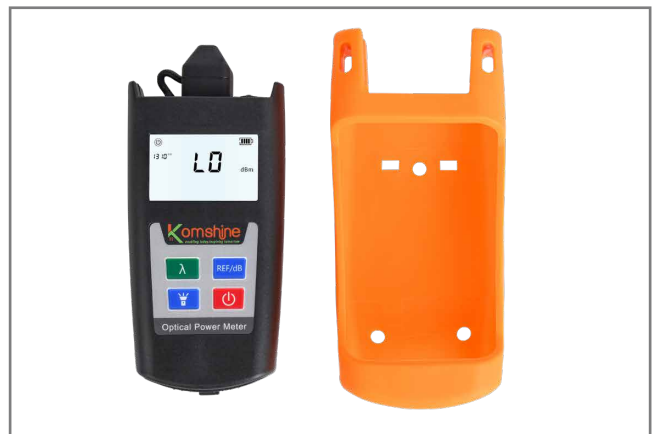
Separate protective jacket