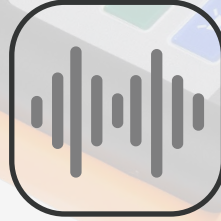
7 Wavelengths detection