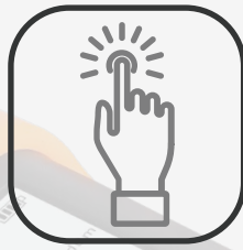
One key start