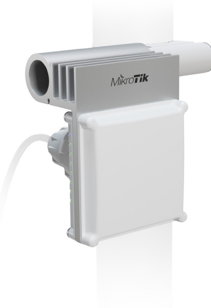
Strong metal base for improved cooling and

If you need to connect multiple devices – take a look at the CubeSA 60Pro ac sector antenna. Reaching distances around 600 meters in point-to-multipoint mode, this device can be very helpful for all kinds of event management: from live shows, festivals, and workshops to construction sites, pop-up vaccination clinics, and so on. No need for complex wired installations in every location – the portable and handy CubeSA 60Pro ac has got you covered! Depending on your setup, the distance can be even greater. For example, with devices like MikroTik nRAY, you can reach up to 800 meters.